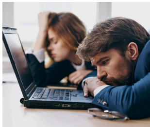
Shot 11: Sad workplace

Employees are sad, depressed and stressed due to environment