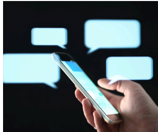
Shot 8: cellphone texts