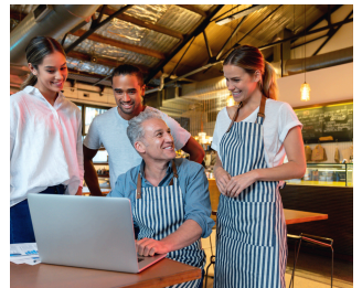
Shot 12: Boss calls meeting

Employees are sad, depressed and stressed due to environment