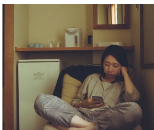
Shot 5: lazy bully

Ace employee sweeping and cleaning the dining area