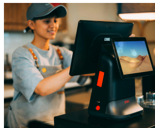
Shot 3: Ace emp cashier

Ace employee performing food prep activities