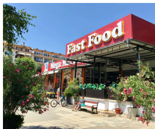
Shot 1 : Opening Shot

Bully is upset that he did not get raised, but another employee did. He begins to text insults about the fellow employee. This impacts morale, his job, future jobs, and the other employees. The Boss models what conflict resolutions looks like.