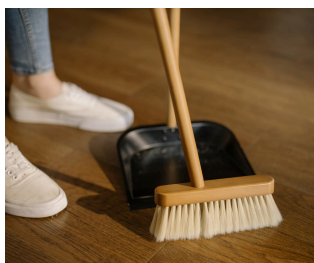
Shot 4 : Ace cleaning

Ace employee is working the cash register