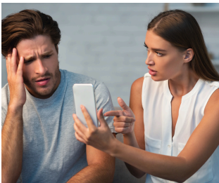
Shot 10: Boss Sees text