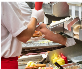
Shot 2 : Ace employee prep

Wide framed shot of business. Can hear atmosphere audio