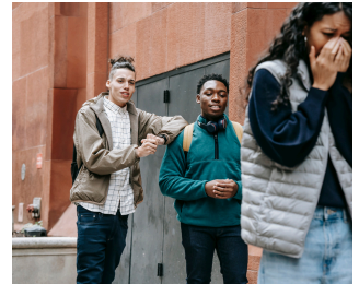
Shot 9 : Group of friends