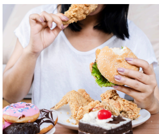
Shot 6: bully eating

Bully is seen sitting and on phone around restaurant